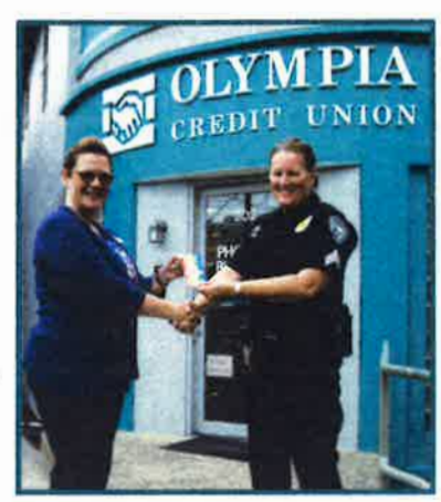
Olympia Credit Union joins the Safe Olympia program.

Businesses or organizations that display the Safe Olympia decal proclaim themselves as allies of the LGBTQ community.