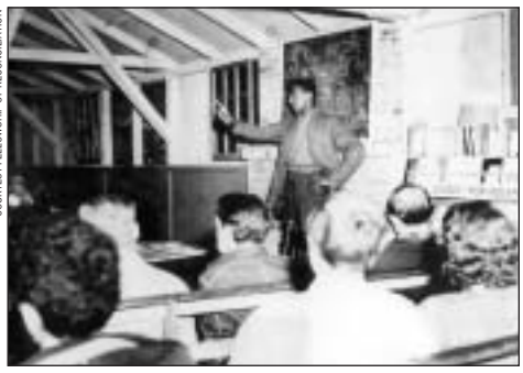
Rustin speaking on nonviolence in 1943.

4. Can you imagine responding to a beating as Rustin did, without fighting back? What do you think this would feel like? How might it affect your opponent?